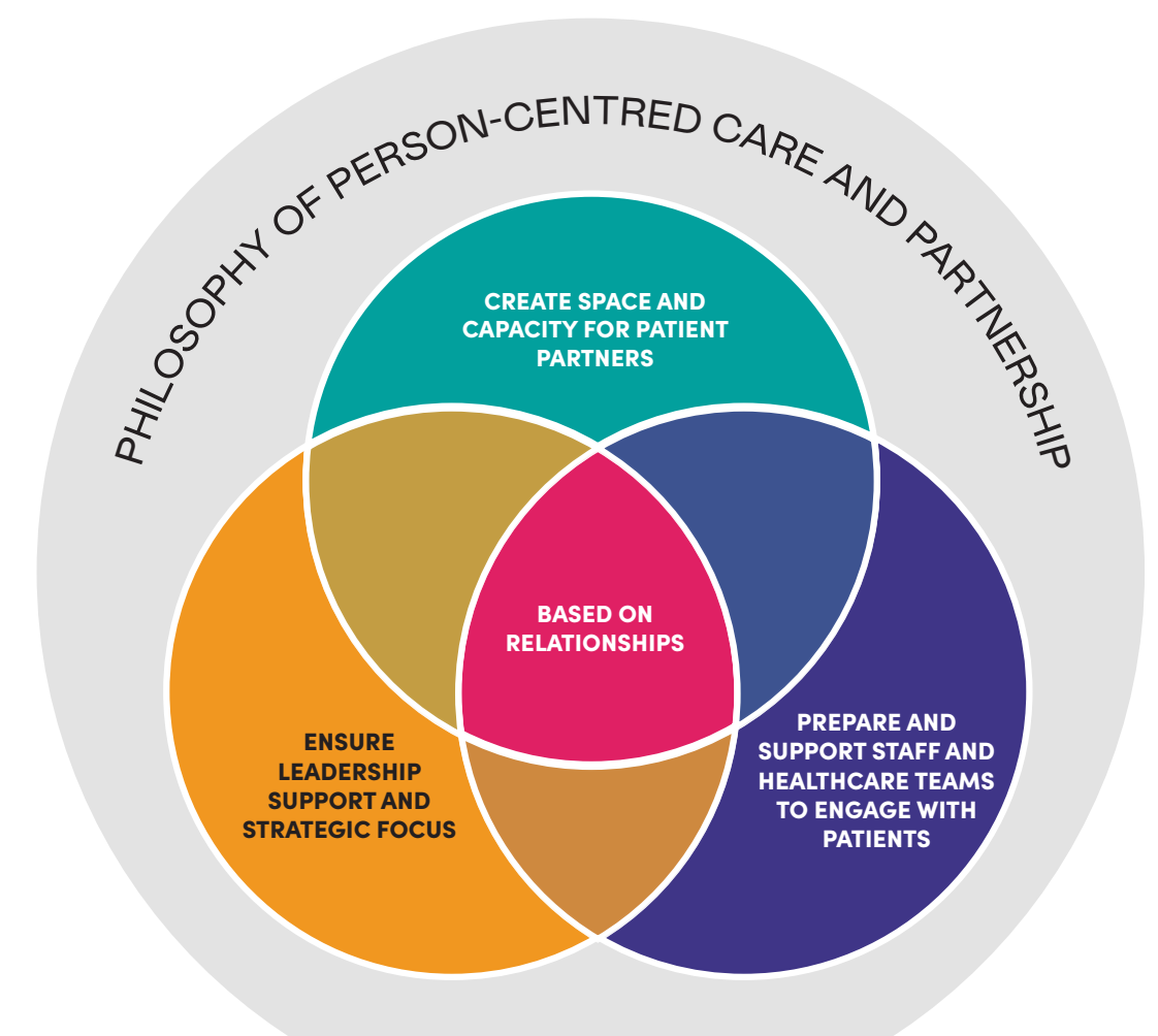
Figure 1. Schematic of Engagement-Capable Environments<sup>5</sup>